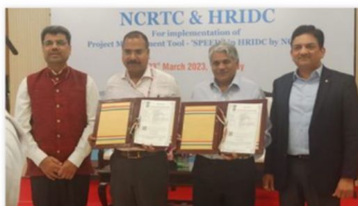
The agreement was signed at the Venue Gati Shakti Bhawan INA New Delhi

Get latest articles and stories on Business at LatestLY. Haryana Rail Infrastructure Development Corporation Ltd (HRIDC) – a joint venture of the Haryana government and Union Railway Ministry – on Thursday signed an agreement with NCRTC (a joint venture company of the Govt of India and the states of Delhi, Haryana, Rajasthan, and Uttar Pradesh) to deploy Systematic Program Evaluation for Efficient Delivery of Projects (SPEED) for smooth monitoring of its projects, an in-house IT solution developed by NCRTC.