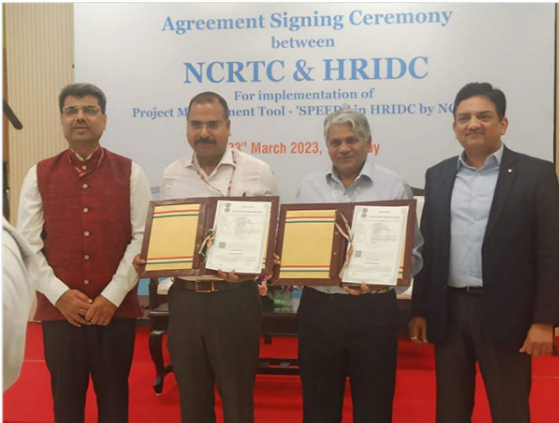
The agreement was signed at the Venue Gati Shakti Bhawan INA New Delhi