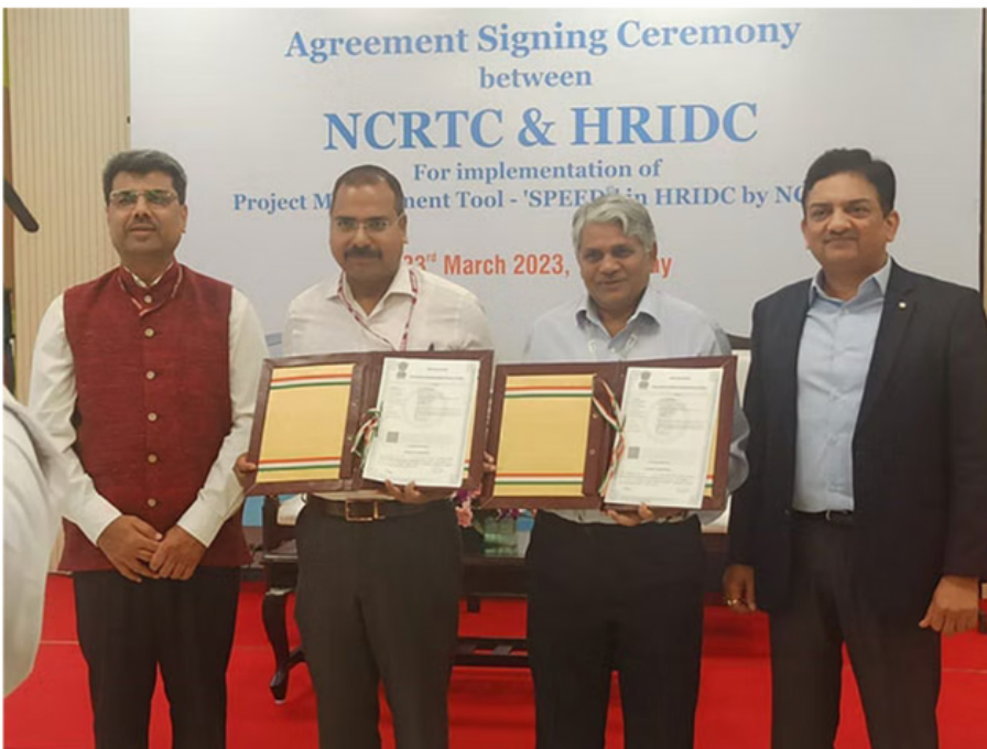
The agreement was signed at the Venue Gati Shakti Bhawan INA New Delhi